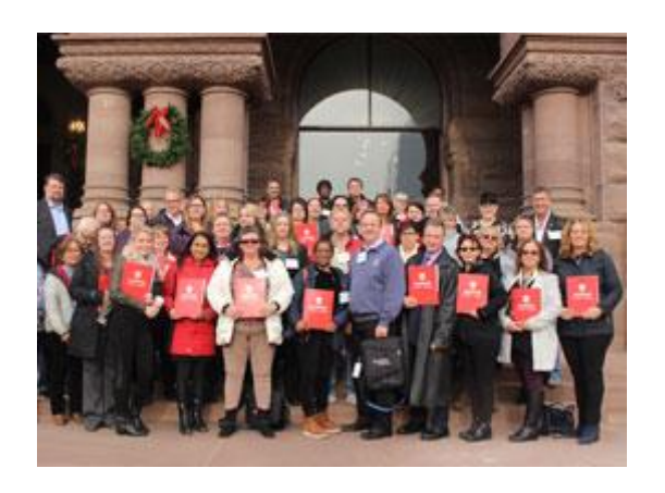
ON members push for four hours of direct care for the long term care sector, in mass lobby.