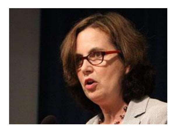
Alberta workers win new rights with overhauled health and safety provisions.