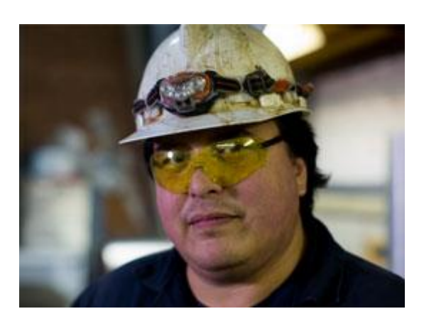
Get the facts about Unifor's legal challenge to Suncor's invasive and unfair random testing.