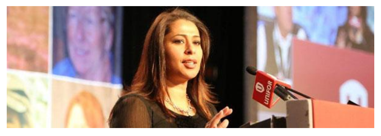
Ontario delegates vow to stop the Conservatives in the next provincial election.