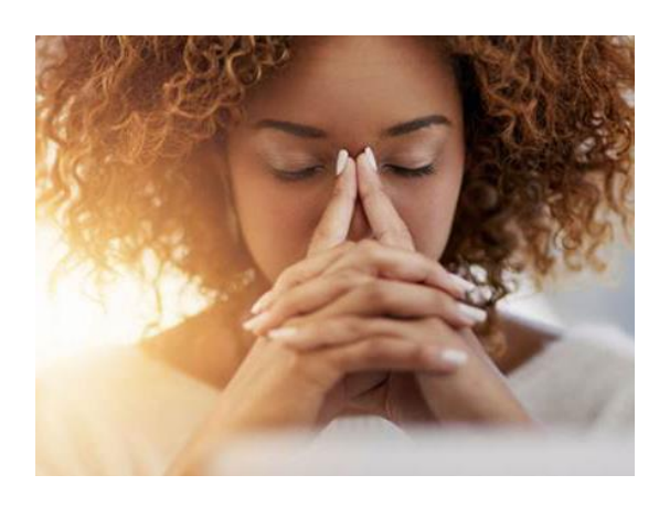
Unifor calls on employers to be more proactive when it comes to developing mental health supports and programs.