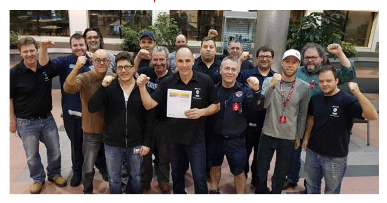
Unifor aerospace delegation is set to lobby MPs next week to secure Canada's advantage in the industry.