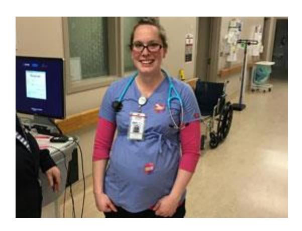
Hospital staff across Ontario take action to demand respect and show support for the tri-union bargaining campaign.