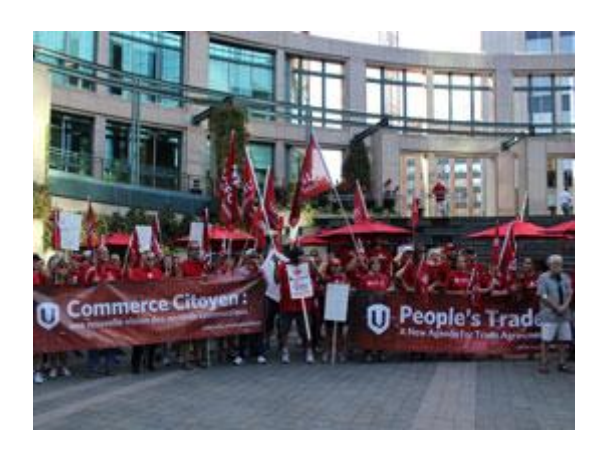
A Rush NAFTA deal agreed in principle is at workers peril.