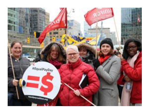
April 10 marked Equal Pay Day, and while there are more steps toward gender justice, there are signs of hope too.