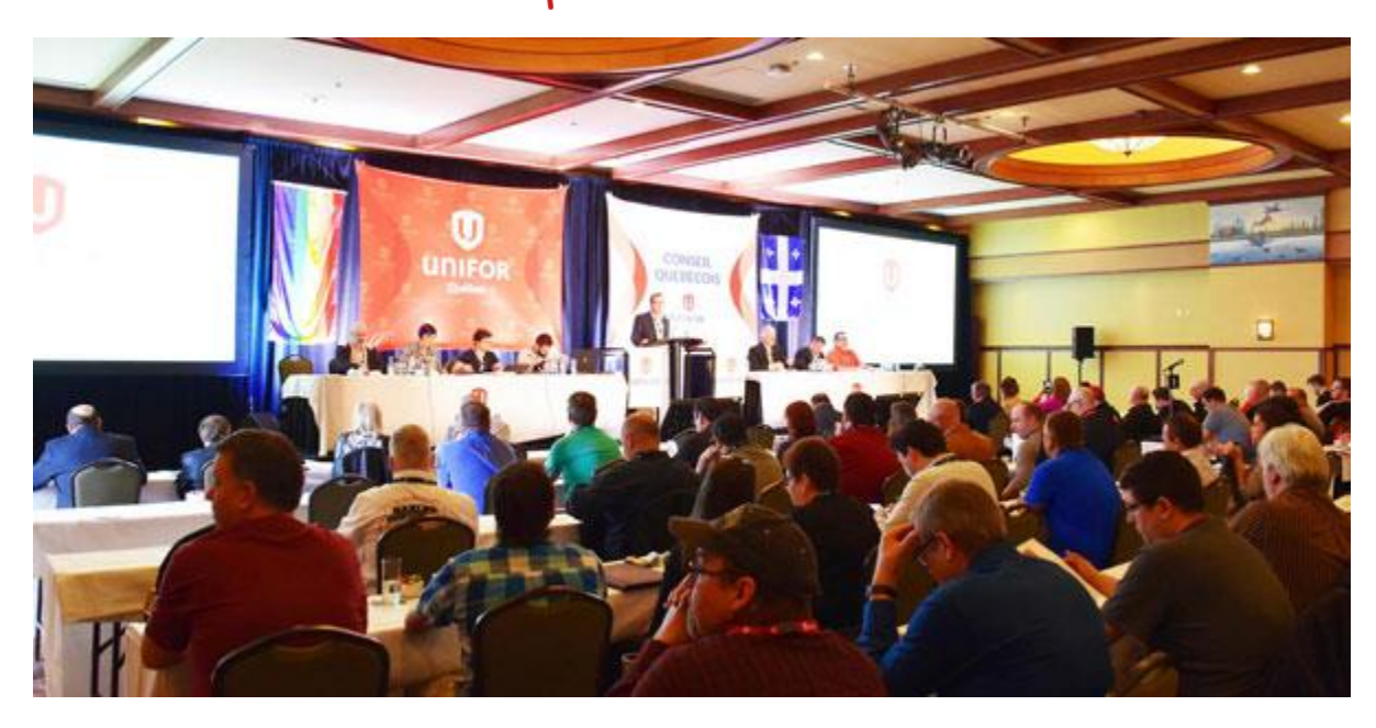
Delegates gathered for Quebec Council to discuss the coming provincial election and more. Watch the video.