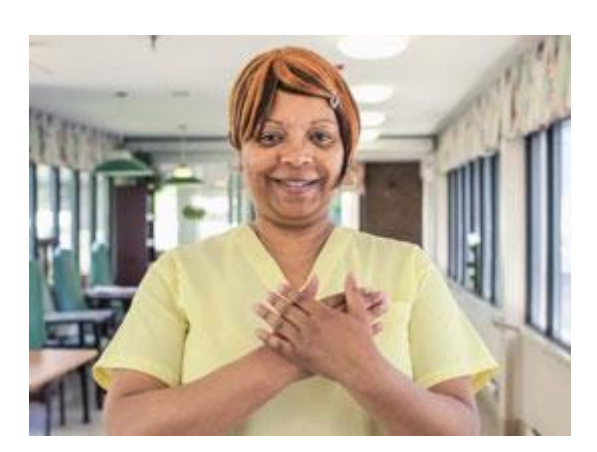
Welcome the newest members, all joining in May from seven workplaces. 1,900 have made Unifor their union this year.