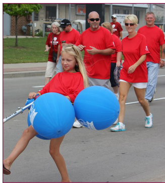
abour Day attracted everyone from children to retirees in Halifax. Port Elgin and Windsor.