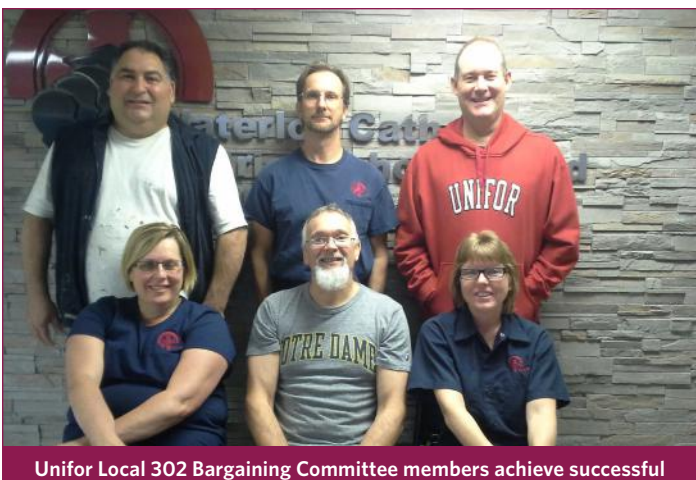
Jnifor Local 302 Bargaining Committee members achieve successful deal following challenging negotiations.

The contract also contains express provisions